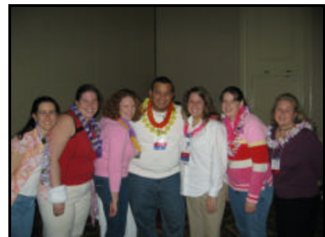
New member Pinning