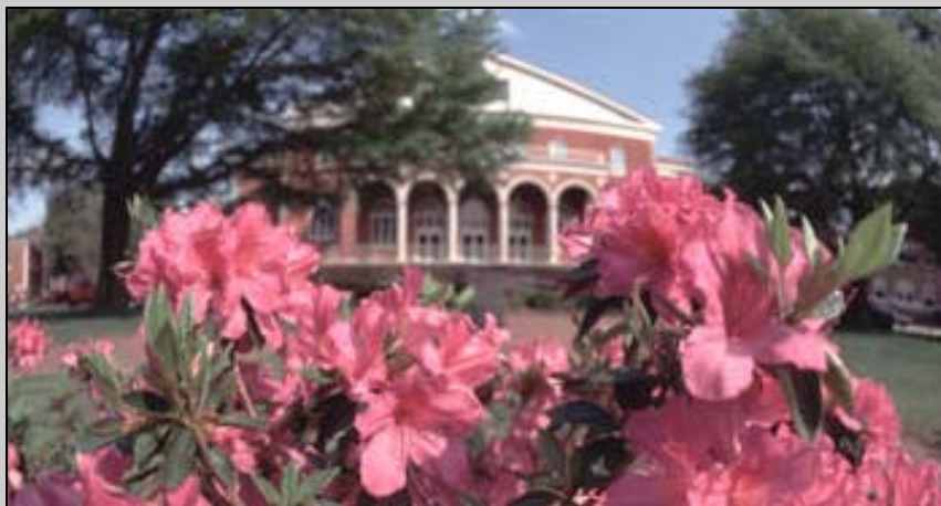
East Carolina University campus