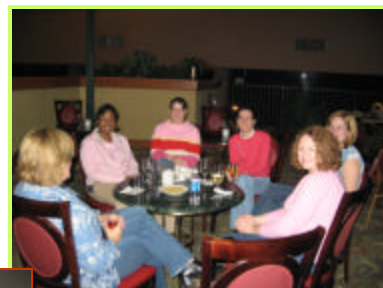
"Free" Drinks for All