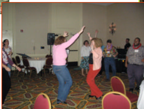
Remember: "It's Raining Men"?