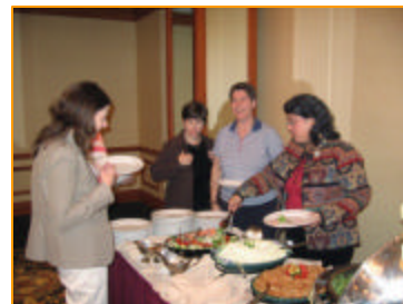
Lunch before we leave