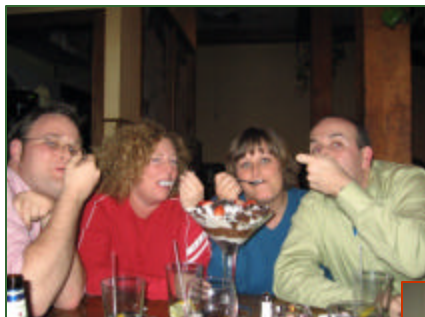
Dinner on the Town